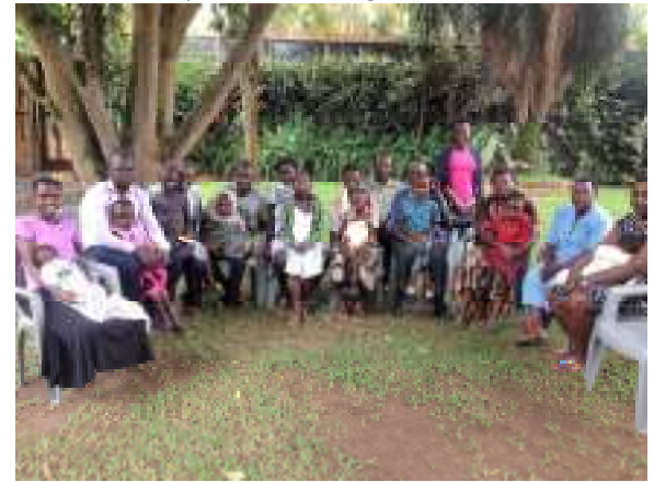
Children and parents are at briefing session in Uganda