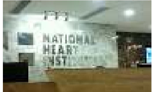
NATIONAL HEART INSTITUTE (NHI)