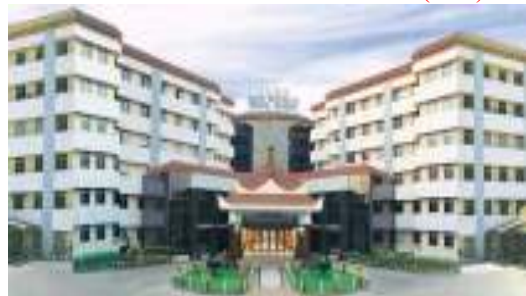
AMRITA INSTITUTE OF MEDICAL SCIENCES (AIMS)