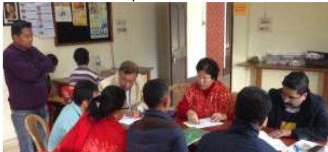
Counselling and interaction session in progress with parents of children for their travel & logistics planning