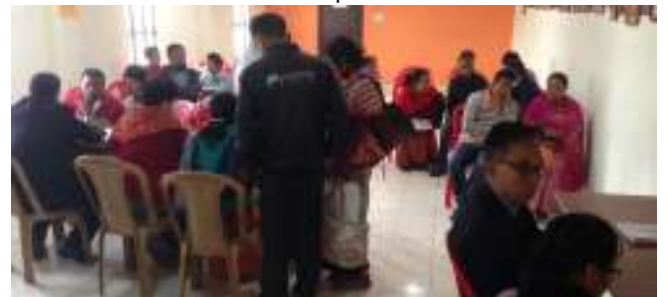
to Delhi for GOL surgery at Rotary Club of Imphal on 10 December 2015.