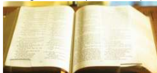
Monthly bulletins of Gift of Life, from Sept 2006 onwards, can be viewed/downloaded at http://groups.yahoo.com/group/giftoflife_india/files/Gift%20of%20Life by joining 'giftoflife_india' yahoo.group