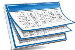
Admission dates of children for open heart surgeries at Fortis Escorts Heart Institute, New Delhi for January and February 2016 and National Heart Institute, New Delhi for January 2015 have been already finalised and informed the GOL Coordinators for onward transmission to beneficiaries selected for reporting on given dates.